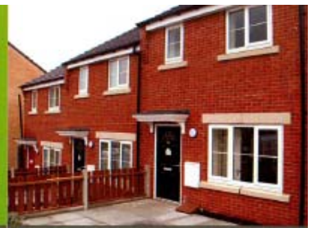
Bramall Construction pilot recycled products on a project to build 12 new houses.

Bramall Construction specialises in the construction and refurbishment of social housing. As part of the larger Keepmoat Group the organisation already has a commitment to corporate social responsibility and Bramall were keen to extend this to their procurement processes using the Buy Recycled programme.